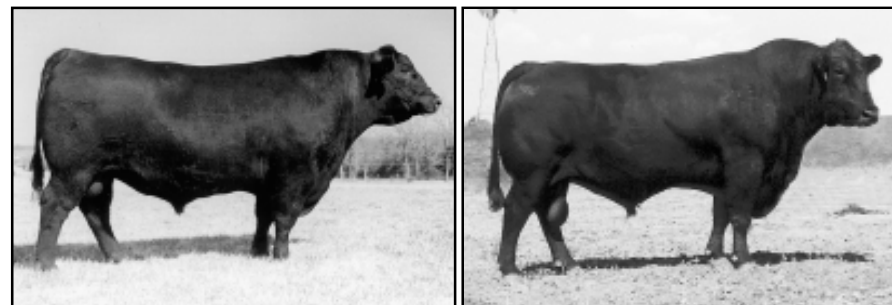
LT 598 Bando 9074