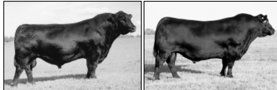
Boyd New Day 8005