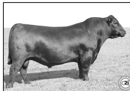
SAV Bismarck 5682