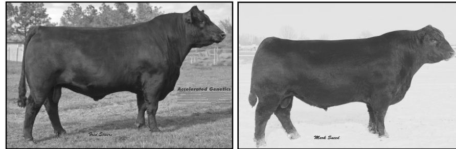
KCF Bennett Performer