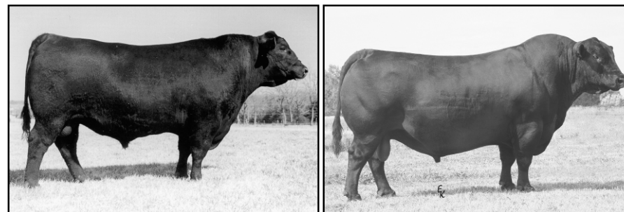
LT 598 Bando 9074