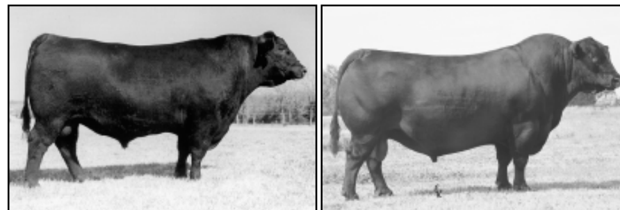
LT 598 Bando 9074