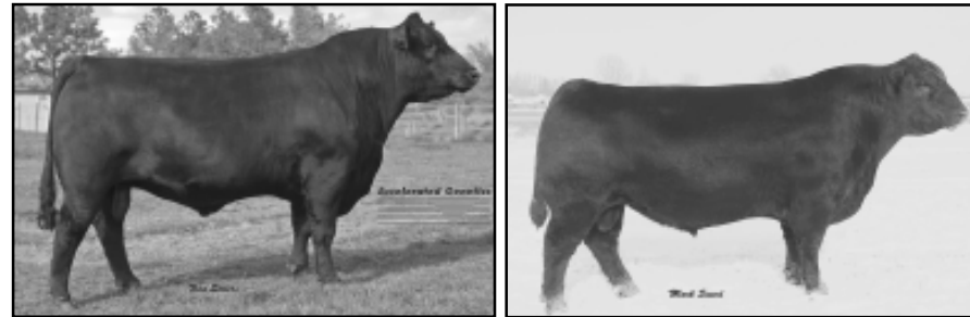
KCF Bennett Performer