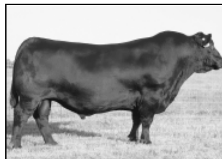
SAV 8180 Traveler 004